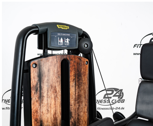
personalisation of stack machine cover